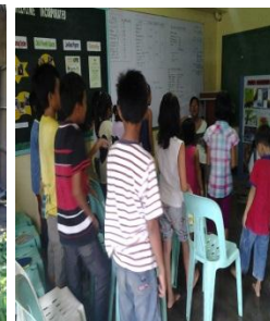
Daily Vacation Bible Study Talent Showcase (Poem)