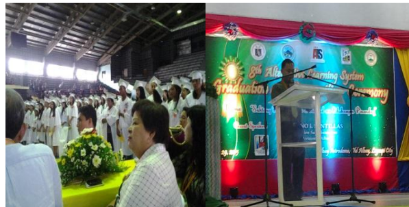
ALS Graduation at Albay Astrodome last July 29, 2015