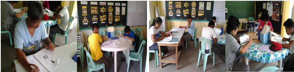
Modular Instruction for ALS students