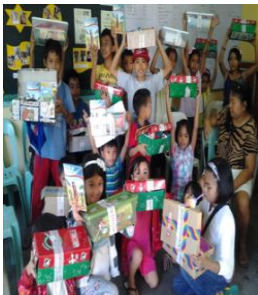
Operation Christmas Child