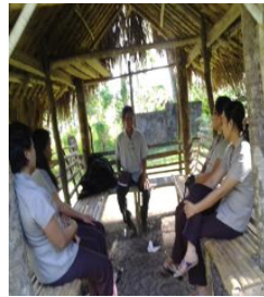
Values Formation for teachers & their pupils