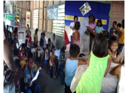
Bible Storytelling & Games for Children