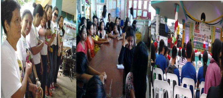
Participated in Bata Muna Movement-Bicol Activities