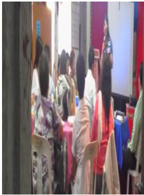
Meeting with the partner schools