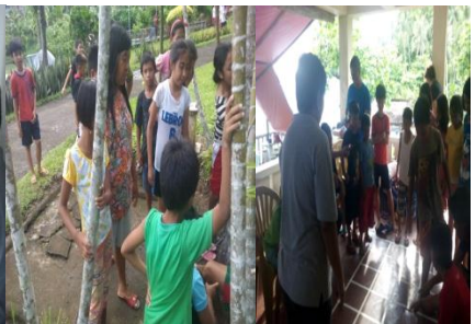
Children's Camp 2015