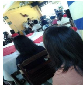
Meeting with the Parents