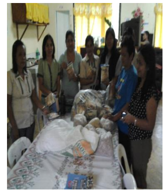
Distribution of Manna Pack Rice