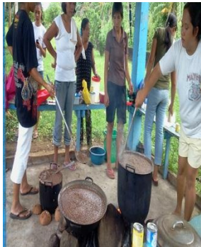
Parents come together to cook meal for their children enrolled in a public school.