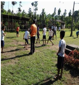
Distribution of Soccer Balls