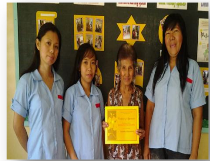
The beneficiary holding her certificate of completion on Dressmaking Training