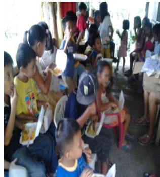
Feeding program for kids