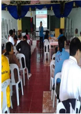
Seminar on how to make Project Proposal & Proposal Writing