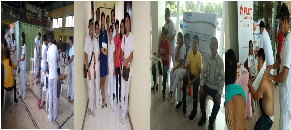
Guinobatan Social Hall DOH Albay