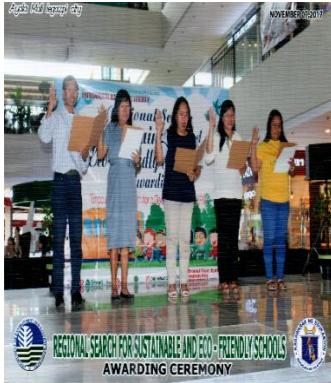
Oathtaking of the Officers of the Core Group

In order to strengthen the awareness of the public and communities and to have a collaborative efforts among the different sectors of the society in the environmental protection and conservation, the DENR-EMB V sought the assistance of the Civil Society Organizations. The AGHLI was one of those selected organization and was elected as officers of the core group. Below are the pictures of activities conducted by the core group.