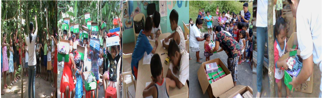
Daily Vacation Bible Study