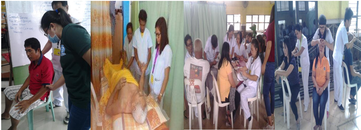
Free massage for senior citizens of Lower Binogsacan

The Mission of Guinobatan Chapter Community Service Massage Team is dedicated to making a positive difference in the health and welfare of the public through the power of compassionate, professional touch offered through the art and science of massage therapy. The AGHWMS members find the events to be fulfilling in many ways. Not only do they get to network with one another; they get to give back to the community, which in turn warms their hearts and gives them a good feeling. Not only do they extend their compassion, they also help introduce massage to those who may never have entertained the idea of getting one.