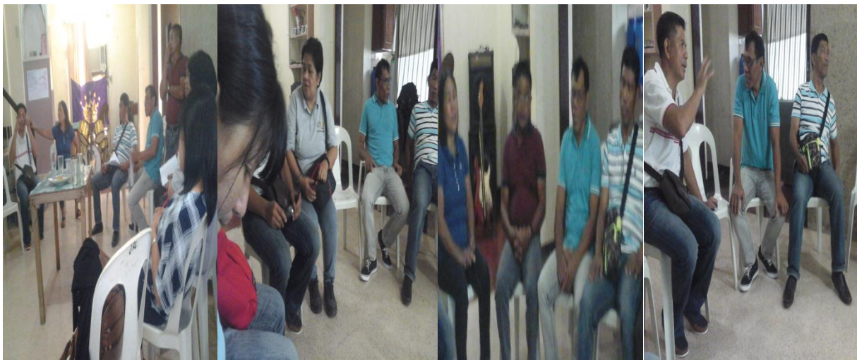
Open discussion with the participants