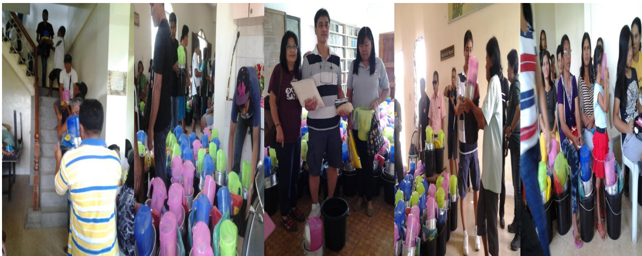
Distribution of supplies to 200 people affected by typhoon Nina