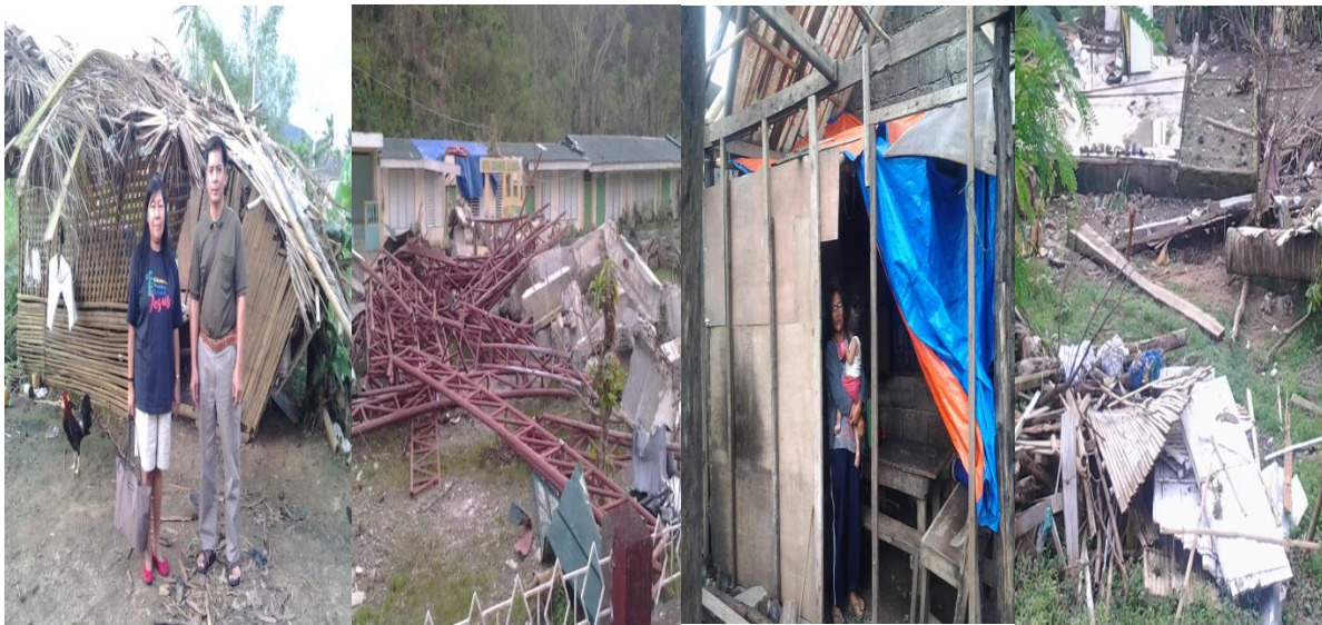
Ocular Inspection after the typhoon Nina

After a month that typhoon Nina hit Catanduanes, families still need to rebuild physically, spiritually and emotionally. The worst affected areas of Catanduanes are Virac, San Andres, Bato, Panganiban, Gigmoto, San Miguel and Baras. In line of this, our organization thru the support of ACTION INTERNATIONAL working tirelessly to provide relief aid and food to hundreds of people affected by this horrific typhoon, collecting fund and distributing life-saving supplies. Below are photos of their actions.