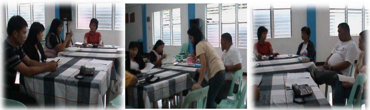
AGM of the organization officers & staff. Sitting at the table are its officer bearers: president, vice-president, treasurer, secretary & board members.