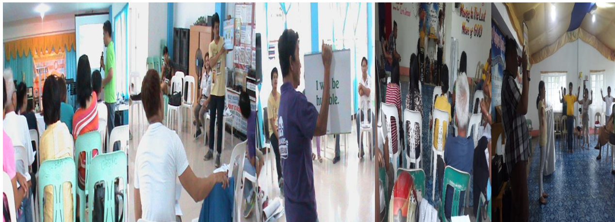
Values Orientation in Classroom Education/Basic Training Seminar to Volunteer Teachers