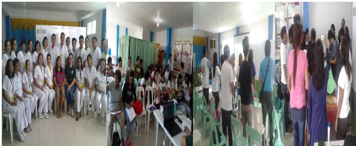
The graduates of wellness massage

After the training the Wellness Massage NC II trainees have attained a 100% pass rate in their TESDA Assessment last February 24, 2017 at Southern Luzon Technological College Foundation, Inc. Pasig City and were able to create association of therapist from Guinobatan named the Amazing Grace Health & Wellness Massage Services.