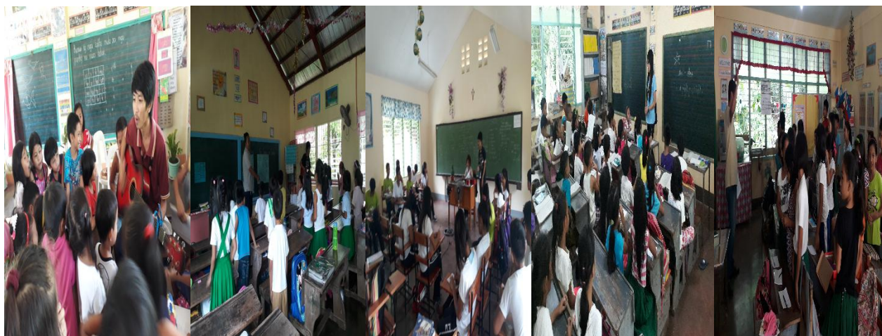
Values Instructional Class